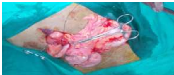
FIG 2 – Operative photograph showing enormously dilated second part of duodenum anastomosed to retrocolic Roux-en-Y jejuna limb.